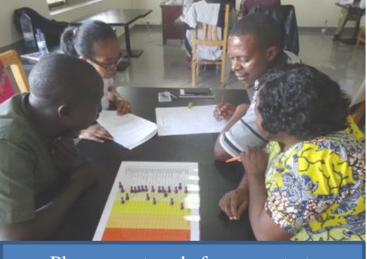
Plan your steps before you start.

In spite of what many may think, self-discipline is scholarly conduct. It requires practice and repetition in everyday life. At the core of any successful individual, is self-discipline. Regardless of whether it's an accomplishment in their own personal lives or their professional work lives, everything begins with selfcontrol through discipline. In the event that you need to accomplish the objectives you set, seeing how to train yourself is a key fixing to the achievement formula.