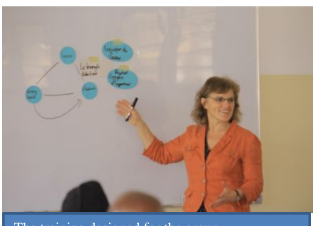
The training designed for the group.

26 teachers attended the workshops as a permanent participant and 24 others for the didactic (non-permanent) evenings, of which there were 10 students. The content of the training was focused on university didactics. To become immersed in the contextual reality of the university, the trainers began the training with a joint opening lecture. In the course of the latter, they proceeded by three fundamental and open-ended questions: These were "What is the quality of a course at the